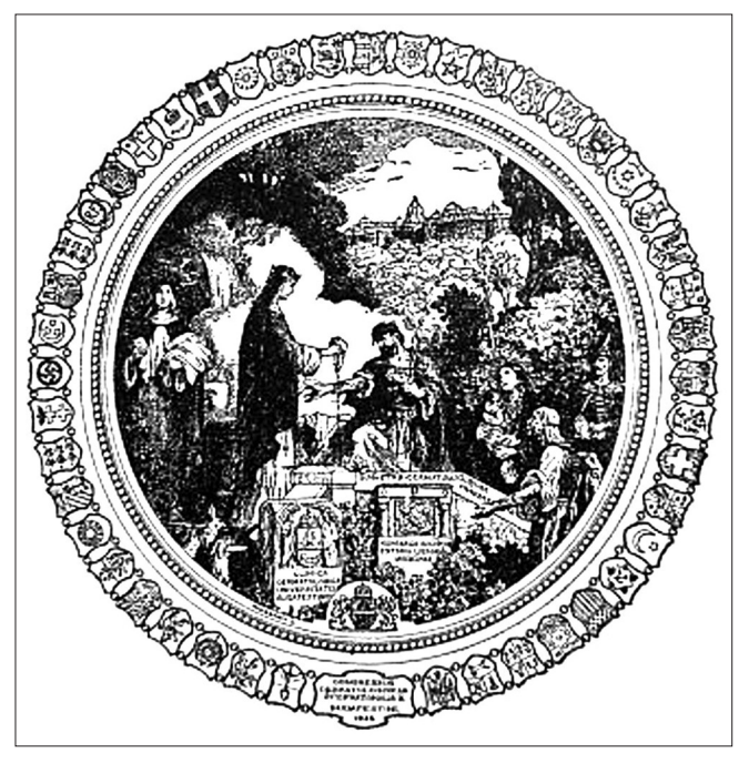
Figure 3: The emblem of the 9<sup>th</sup> International Dermatological Congress in Budapest 1935 (displayed on the first introductory page of the Corpus Iconum Morborum, Cutaneorum)

The atlas consists of three separately bound books. The first one contains only texts—short clinical explanations