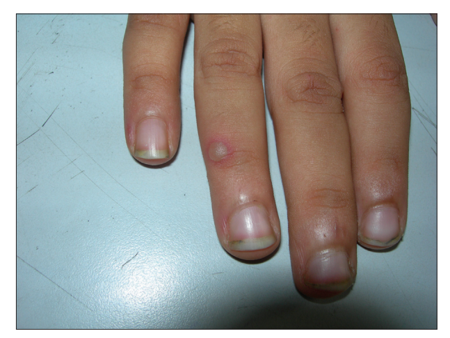
Figure 3: Classical greyish vesicle with erythematous halo on finger