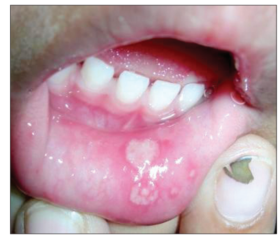
Figure 2: Oral mucosal vesicular lesions in Hand, foot, and mouth disease

skin like palms and soles may not develop classical vesicle; they may instead persist as erythematous papules [Figures 1-6]. Disease usually improves spontaneously after 7-10 days without any complication.