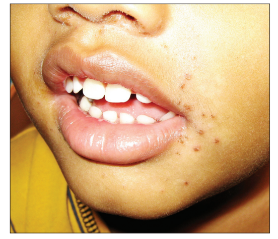
Figure 1: Perioral grouped vesicular eruptions in Hand, foot, and mouth disease

areas like hand, feet, perioral area, knees, buttocks and also intraorally. Vesicle fluid is initially clear but rapidly becomes turbid mimicking pustules. There is characteristic perilesional erythema. Lesions in thick