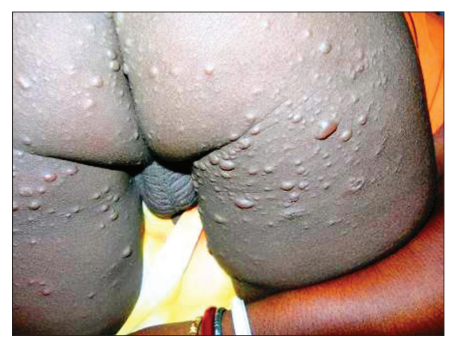
Figure 5: Grouped vesicles on buttocks (Figure 2 and 5 have been reproduced from reference no. 109 with prior permission)

skin like palms and soles may not develop classical vesicle; they may instead persist as erythematous papules [Figures 1-6]. Disease usually improves spontaneously after 7-10 days without any complication.