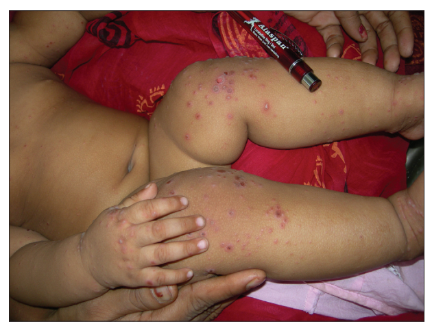
Figure 4: Grouped vesicles on knees in a child