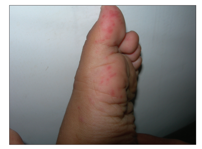
Figure 6: Erythematous papules and ill-formed vesicular eruption on medial margin of foot. (Figure 3, 4 and 6 have been reproduced from reference no. 51 with prior permission)