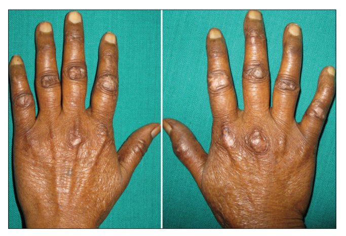
Figure 1: Shiny erythematous papules and plaques on the dorsa of bilateral hands

A 45 year old woman presented to us with an eruption on the dorsa of the hands of 2 years' duration. She had been treated for the past 5 years with oral hydroxyurea (HU) 1.5-2 g/day for chronic myelogenous leukemia. Examination revealed presence of shiny eythematous papules and plaques with mild scaling, on the dorsa of the metacarpophalangeal and proximal interphalangeal joints of bilateral hands [Figure 1]. She had no other eruptions in photodistributed areas, heliotrope rash, or any evidence of muscle weakness. Laboratory evaluation revealed normal serum chemistries including creatine phosphokinase, negative antinuclear antibody, and rheumatoid factor. Histopathological examination of a skin biopsy taken from one of the erythematous papules revealed the presence of slight epidermal atrophy with orthohyperkeratosis, vacuolar changes in the basal cell layer with colloid bodies, melanophages and a slight perivascular lymphomononuclear infiltrate in the upper dermis [Figure 2]. Alcian blue stain revealed mucin deposition in the upper dermis [Figure 3]. Based on clinico-pathologic correlation, a final diagnosis of HU induced dermatomyositis (DM) -like eruption was made. Partial improvement was observed with diligent photoprotection and mild topical corticosteroids. HU was continued considering its importance in CML treatment and mild cutaneous manifestations.