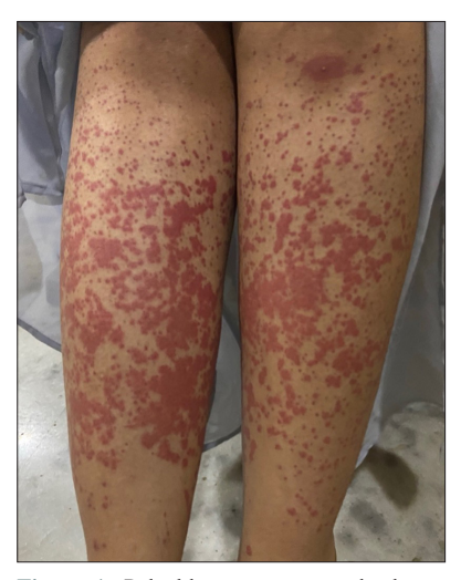
Figure 1: Palpable purpura over the lower extremities.

On examination, there was thickening of bilateral labia majora causing distortion of vulvar architecture. There were multiple, well-defined, firm erythematous nodules of varying sizes (0.5–5 cm diameter) which had coalesced and were surmounted with cerebriform convolutions and deep furrows with superficial erosions and occasional fissuring in the depth of furrows. There was no vaginal discharge [Figure 2]. Further inspection of the perineum showed no anal fistulae,