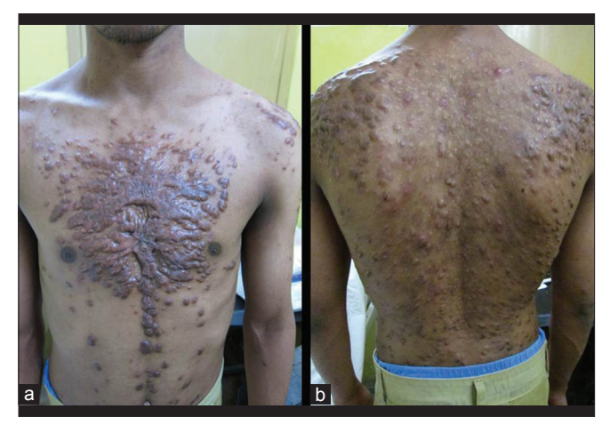
Figure 1: Patient showing multiple keloidal scars over chest, abdomen and back