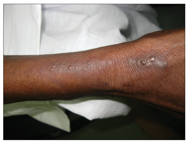
Figure 3: Hyperpigmentation along with vesicles over the cephalic vein of right upper limb

unremarkable. Complete hemogram and routine biochemistry panel were normal. Histopathological examination of a biopsied specimen of the involved skin revealed basal layer degeneration, pigment incontinence. melanophages. focal infiltrate as well as perivascular mononuclear infiltrate. [Figure 4] Based on the clinical pattern and histopathological features, a diagnosis of docetaxel-induced supravenous serpentine dermatitis was made. The patient was prescribed topical steroids and emollients. Venous washing was not done in any of the instances.