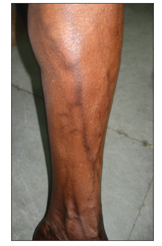
Figure 1: Linear streak of hyperpigmentation along the tributaries of long saphenous vein of left lower limb

pre-medicated with ondansetron, 8 mg twice daily, dexamethasone, 8 mg twice daily, pantoprazole, 40 mg, and chlorpheniramine. Docetaxel in the dose of 100 mg/m<sup>2</sup> was administered in a 250-ml polyvinyl chloride-free sodium chloride 0.9% bag over 1 hour. After receiving his first dose of docetaxel infusion along the left lower limb, he experienced severe pain around the injection site which subsided spontaneously in 2 days. Following this, he noticed a red line spreading along the path of infusion of the drug. The erythematous line was subsequently replaced by dark-colored streaks [Figure 1]. The next doses of the drug (100 mg/m<sup>2</sup> in a 250 ml polyvinyl chloride-free sodium chloride 0.9% bag over 1 hour) were subsequently administered along the veins of the right and left forearms and a similar clinical course of events was noticed. [Figures 2 and 3] Cutaneous examination revealed linear streaks of hyperpigmentation along the tributaries of long saphenous vein of left lower limb and also along the veins over the extensor aspect of left forearm. Some vesicles were also noted over the cephalic vein of right forearm. The veins underlying the pigmented streaks were neither tender nor thickened. There was no regional lymphadenopathy. Examination of the palms, soles, and mucous membrane was