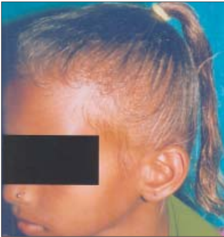
Figure 2: Sparse, blond, hypopigmented hair (Case 1)

On investigations, X-ray hands and feet confirmed the clinical findings. Her USG abdomen and pelvis were normal. Skin biopsy showed normal appendages. In view of these findings, the possibility of EEC syndrome was considered and other family members were evaluated.