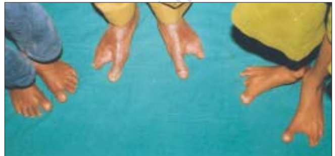
Figure 4: All family members showing feet involvement

10 years. He also had complaints of epiphora and deafness. He did not have any sweating abnormality.