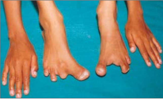
Figure 1: Split feet deformity with normal hands (Case 1)