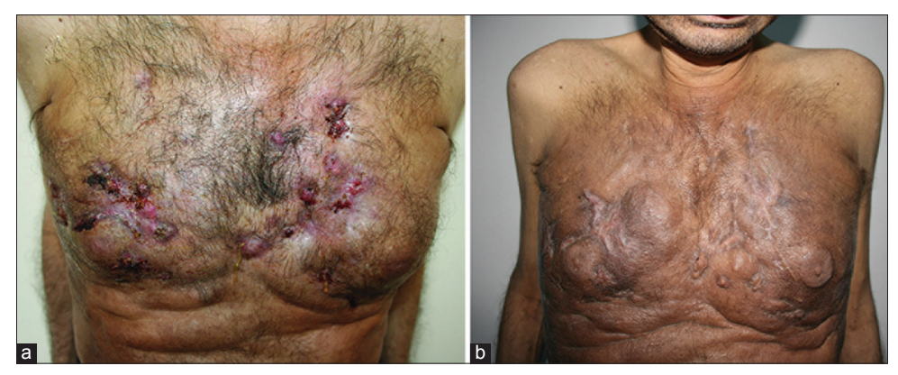
Figure 1: (a) Multiple, erythematous and indurated draining nodules on both breasts and thoracic wall. (b) Significant improvement of the lesions after 2 months of therapy with hydroxychloroquine