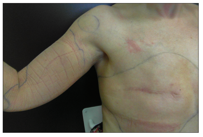
Figure 3: The skin lesions resolved completely after the treatment of systemic corticosteroids for 2 days