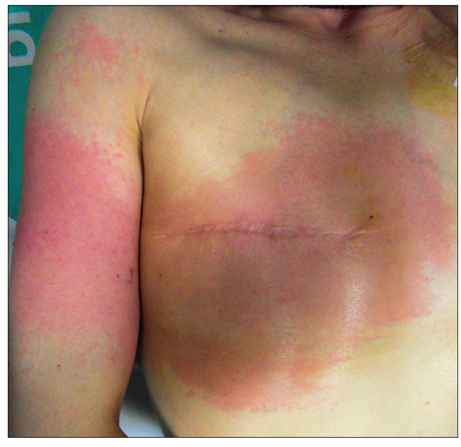
Figure 1a: Erythematous indurated plaques with patched involvement of right pectoral, shoulder and upper arm affected by postmastectomy lymphedema

Physical examination showed cutaneous lesions placed in her right half of the upper body (arm, shoulder and pectoral region).