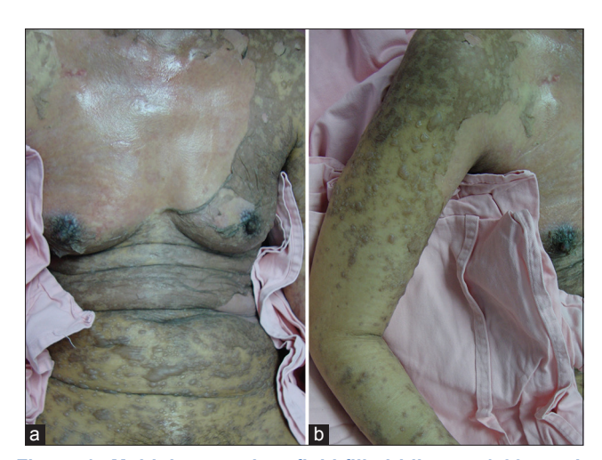
Figure 1: Multiple new clear fluid-filled blisters, 1-30 mm in size, erupted rapidly on (a) trunk, (b) arms, thighs, and neck in 1 day during remission stage. Re-epithelialization of the original detached wound could be seen on chest