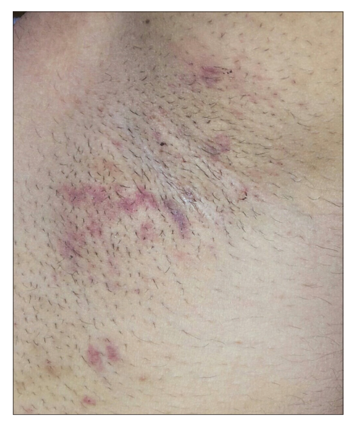
Figure 4: Ecchymosis following percutaneous ethanol injection in a 24-year-old male

**Ethanol intoxication include respiratory depression, cardiac arrhythmias, seizure, behavioral changes, nervous system depression and macroscopic hemoglobinuria. SD: Standard deviation