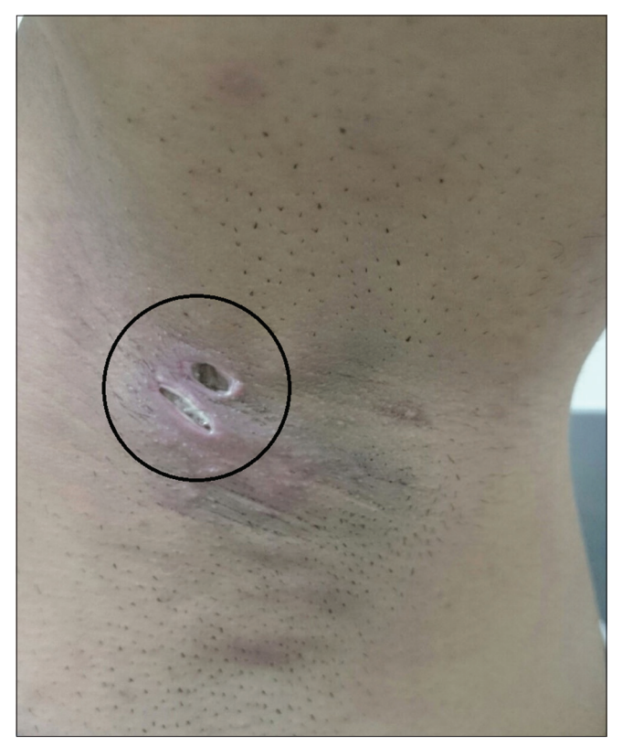
Figure 5: Ulceration five days after percutaneous ethanol injection in a 30-year-old male

Percutaneous ethanol injection is an effective alternative method for treatment of axillary osmidrosis. Complications are mild to moderate but transitory and self-limited. Our study is a primary study for evaluation of clinical efficacy and safety of percutaneous ethanol injection. Comparative studies are needed to confirm if the response is sustained for a long time.