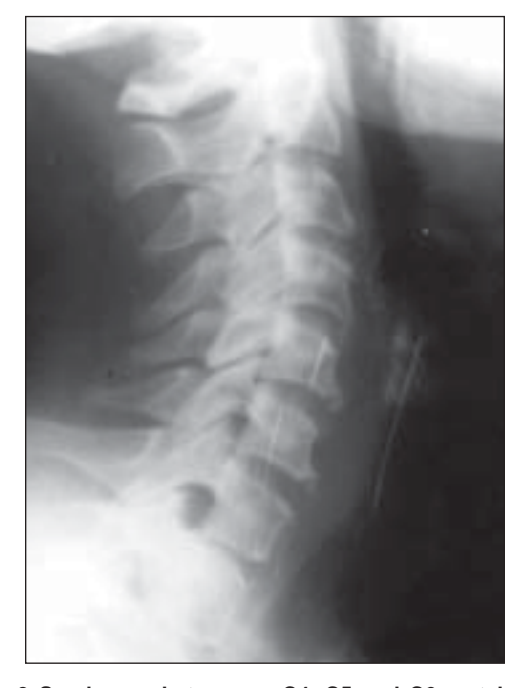
Figure 3: Syndesmophytes over C4, C5 and C6 vertebrae

inflammatory bowel disease is one of the best examples of a disease association with a hereditary marker. [4,5] The risk of Reiter's disease development in HLA-B27 carriers is 27 times higher than the mean incidence of this disease in the population. [6,7] The incidence of anterior uveitis in Reiter's syndrome is significantly higher with HLA-A9 and -B40 antigen combinations as compared to -A1 and -B27. [6,7]