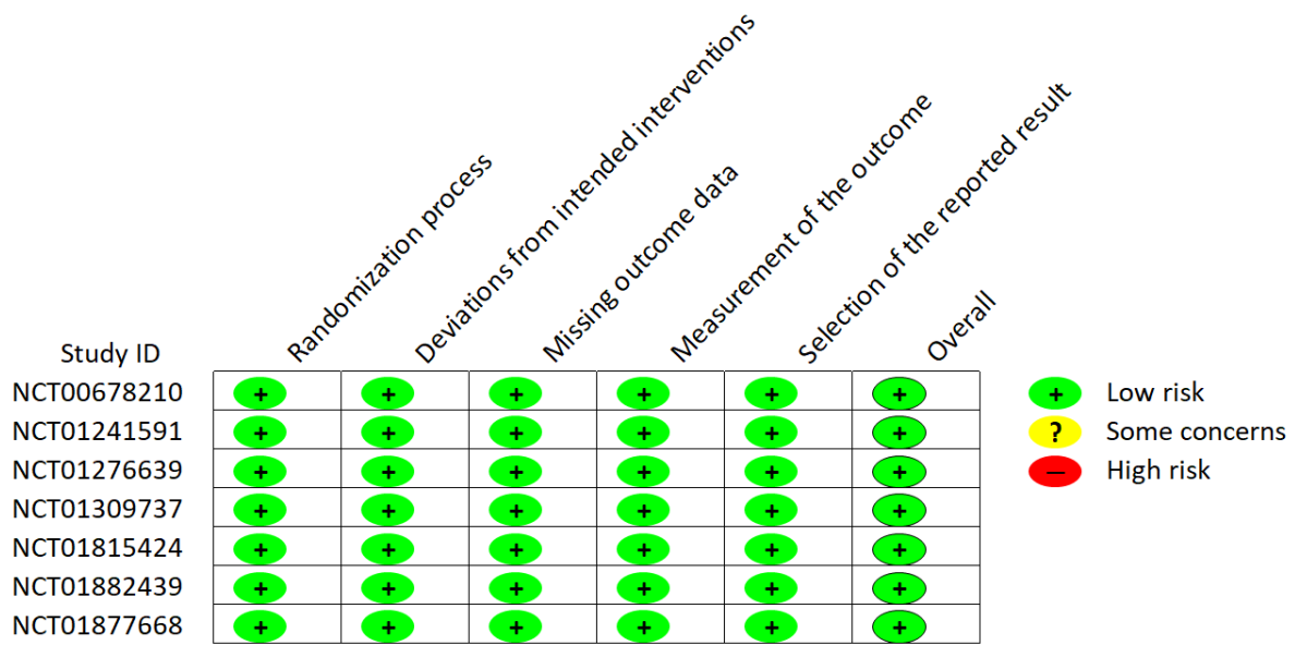
Figure S1 Risk of bias assessment for included studies.